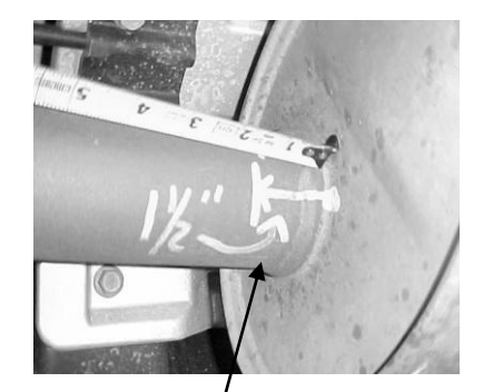
Cut here to remove for 00-02

INSTALL MUFFLER # B ONTO HEADPIPE WITH INLET TOWARDS CONVERTER USING CLAMP #E. USE A JACK STAND TO SUPPORT THE MUFFLER. MAKE SURE THE MUFFLER IS LEVEL.THE OUTLET OF THE MUFFLER WILL BE AT ABOUT 7 TO 8 O'CLOCK. THE MUFFLER INLET WILL BE LOOKING INTO THE LOUVERS TOWARDS THE MOTOR. ATTACH HANGER #D TO OUTLET OF MUFFLER AND INSERT INTO WELDED HANGER.