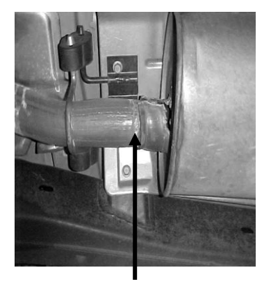
Remove here for 98-99

9/16" SOCKET + WRENCH, \frac{1}{2} " SOCKET + WRENCH, HACK SAW, JACK STAND, 15MM SOCKET, WD-40